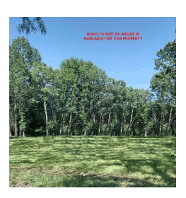
BUILD TO SUIT BY SELLER Home or Storage Building or Both

Property # 276 $77,000 S O L D South 4465 Road Langley, OK (Grand Lake)