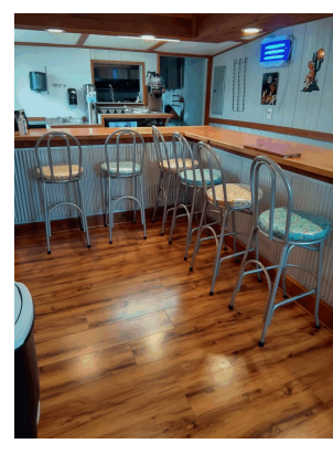
Building Size SF:432± Sq. Ft. Restaurant Building, Plus 2 Auxilliary Buildings for Storage