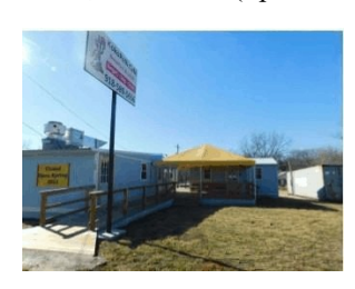
TURN-KEY OPERATING, SUCCESSFUL RESTAURANT BUSINESS and REAL ESTATE